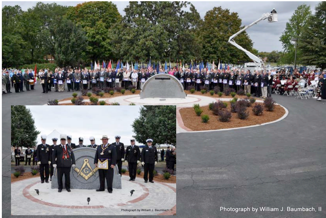
Dedication of the Masonic Monument to the World War II Veterans on October 10, 2009